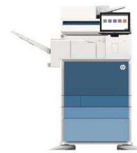
6GW49A Inner Finisher* Staples up to 50 sheets OPTIONAL: 2/3 Hole Punch Module 155P7A