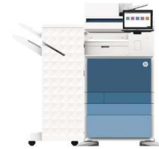
6GW55A Stapler/Stacker Finisher Staples up to 65 sheets OPTIONAL: 2/3 Hole Punch Module Y1G10A