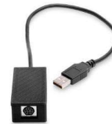
Foreign Interface Harness (B5L31A)