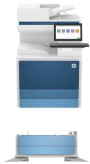
6GW47A Dual cassette feeder (2x520)