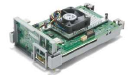
HP LaserJet Workflow Accelerator Card- FLOW UNITS ONLY (6HN30A)