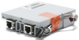
MFP 800/810 Analog Single/Dual Fax (7ZA08A/5QK14A)