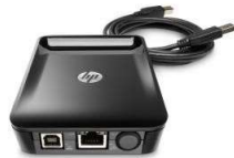
JetDirect LAN Accessory (8FP31A)