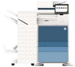
6GW51A Booklet Finisher Staples up to 65 sheets OPTIONAL: 2/3 Hole Punch Module Y1G10A