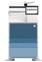
6GW50A Job Separator