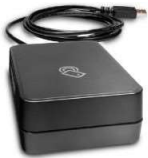
JetDirect 3100w BLE/NFC/Wireless Accessory (3JN69A)