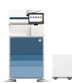
6GW56A Side High-capacity input (1x3000) Letter/A4 only